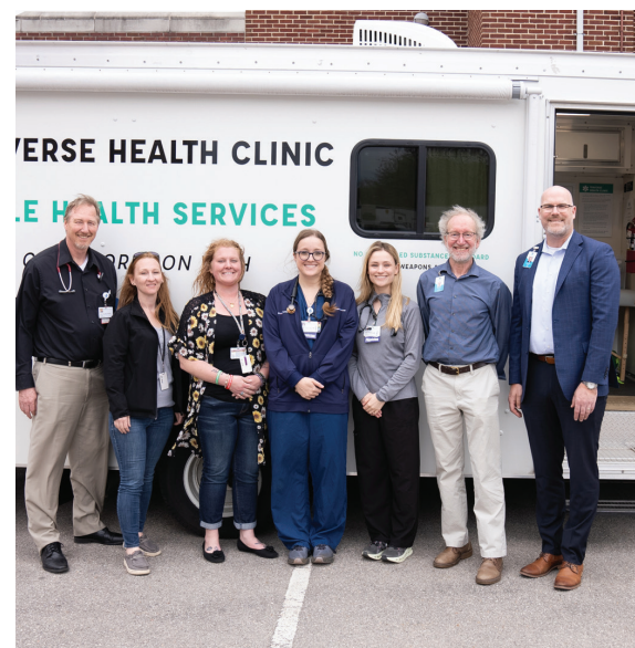
Led by Traverse Health Clinic, the Street Medicine program provides medical care to the unhoused. Munson's $300,000 investment over two years supported a program director and expanded services from Traverse City to Cadillac, with medical residents delivering direct care.

In addition, Munson supports the Community Connections program , a regional partnership with health systems, physician offices, and local health departments. Community Connections plays a vital role in addressing the full spectrum of SDOHs. Referred patients receive one-on-one, confidential support to access essential resources such as housing, food, transportation, and healthcare. Services are delivered through phone calls, office visits, and home visits—helping people navigate complex systems with dignity and care. In 2025, more than 2,000 patients were referred for support.